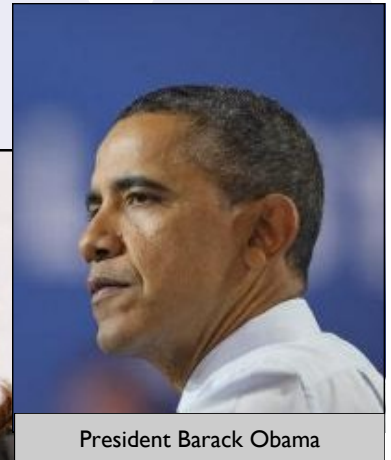
President Barack Obama