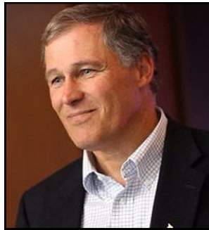
Jay Inslee For Governor

These great leaders serve us with integrity and experience. They'll need our help in the months ahead!