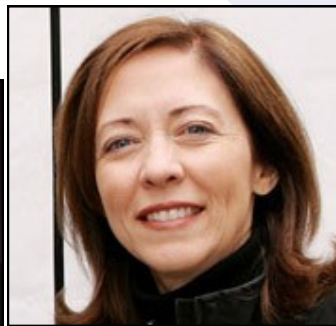
US Senator Maria Cantwell