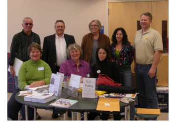
2010 DCDem Platform Cmte

costs for a local Democratic headquarters office during national election campaigns; and