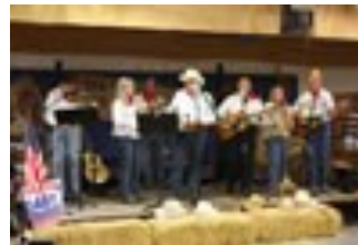
The Vote Rockert—10/2009

this year’s event will all be dedicated to helping fund our HQ Office. Please buy your tickets early and consider inviting a new friend to attend with you! Support our local Democratic efforts in 2012.