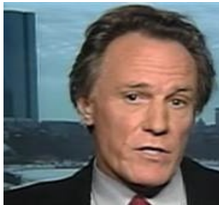
New York Times bestselling author, Frank Schaeffer