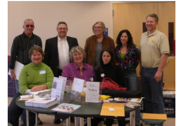
2010 DCDem Platform Cmte

costs for a local Democratic headquarters office during national election campaigns; and